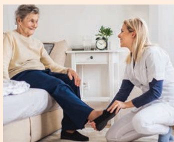
NEUROGENX® HEALTHSTRIDES PROFESSIONAL AFFILIATE PROGRAM

The bottom line is that, due to a lack of viable treatment options, neuropathy patients are a very at-risk, and underserved population. The complexity of the condition and the lack of knowledge requires