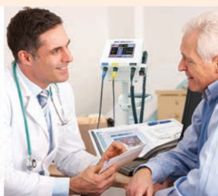
NEUROGENX® NERVEPRO 2.0 ADVANCED NERVE TECHNOLOGY