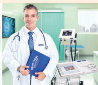
NEUROGENX® SOLUTIONSPROGRAM TURN-KEY MEDICAL BUSINESS SOLUTION

a multifaceted approach to care. The same is true for diabetic patients and the very low utilization of therapeutic footwear, despite its proven ability to help prevent life-threatening wounds and falls.