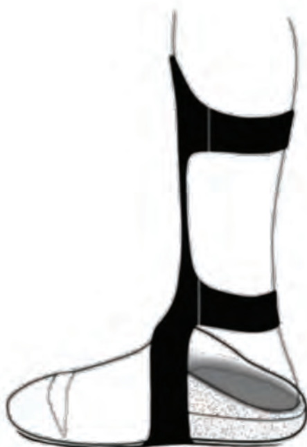
Figure 4: Custom partial foot prosthesis