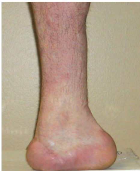
Figure 1: Chopart with 0° CIA, bulbous heel

No amount of cushioning or padding can resolve shearing forces. The only solution to the destructive forces of shearing is to restore the length of the propulsive lever arm. That can be accomplished through the use of a carbon composite AFO that features a full-length footplate and a pre-tibial shell that comes to the height of