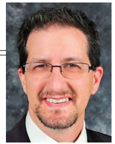
BY JARROD SHAPIRO, DPM