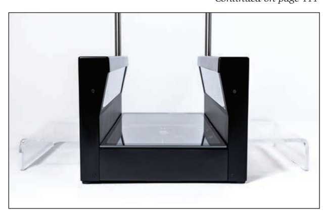
Tiger 3D foot scanner

Additive manufacturing (AM), commonly called 3D printing, was developed in the 1980s and generally refers to a process in which a computer-aided design (CAD) model is printed by adding layer upon layer of material, as opposed to a subtractive manufacturing process in which material is removed from an item, such as carving a canoe from a tree. A 2012 study of AM for foot orthosis design found evidence that "biomechanical changes can be achieved using novel devices which take advantage of the design freedom provided by AM." However, among the obstacles cited were cost and the lack of a complete solution.<sup>1</sup> A 2013 study of patients with early rheumatoid arthritis (RA) found that orthotics produced with CAD and AM, based on 3D gait analysis with biomechanical data from a camera and pressure plate, provided better foot Continued on page 111