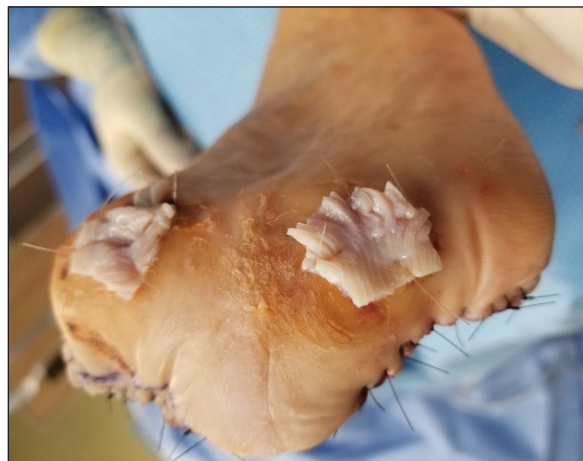
Figure 3: The graft is sutured to the recipient site with 3-0 Monocryl. The surgeon may use a cellular placental graft (Graftix) to improve graft healing and take. The CTP is laid onto the skin graft.

In their retrospective review, the authors report a healing rate that ranged from 3 to 16 weeks with an average healing time of 5.1 weeks.