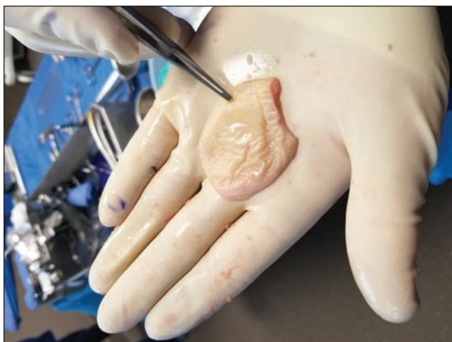
Figure 1b: The graft is harvested using a #10 or #20 scalpel. The same blade is then used to debulk the graft by "scraping off" the subcutaneous tissue.

of advanced products and grafting should be reserved for recalcitrant wounds that have stalled. Today, several options are available, ranging from cryopreserved tissue, live amniotic cells, allografts, xenografts, and autografts. Both full-thickness skin grafts (FTSGs) and split-thickness skin grafts (STSGs) are viable options.