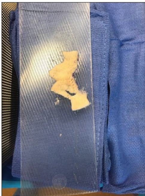
Figure 2: The skin from the amputated toe is placed in a mesher to allow drainage and reduce chances of hematoma or seroma formation.

a subset of the population involving DFUs. Their study reported an average healing rate of 82.4% and a