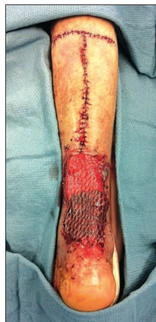
Figure 3: Donor site closed primarily, and recipient site covered with meshed split thickness skin graft obtained from ipsilateral thigh.

Current controversy exists on whether this procedure should be performed as a two-stage or one-stage procedure. In general, a two-stage is recommended if a large pedicle or arc of rotation is planned, and to increase local vascular supply by opening the choke arteries. Supercharging procedures to increase flap vascularity are beyond the scope of this article but can be a consideration intra-operatively. Extrinsic factors such as poor flap design, excessive skin traction, inadequate flap size, twisting or kinking of the flap pedicle, excessive compression, and inappropriate flap design in traumatized or radiated