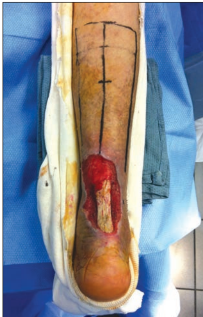
Figure 1: Posterior ankle ulceration with exposed Achilles tendon and large soft tissue defect with proposed incision site marked.

The advantages of the reverse sural artery adipofascial flap include: easy to dissect, not necessary to sacrifice important arterial pedicle, wide rotation arc is possible, and a microvascular anastomosis is not necessary. Disadvantages of the procedure include the sacrifice of the sural nerve and