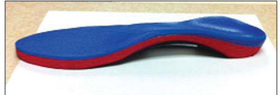
Figure 2: If the orthotic does not support the forefoot past the metatarsal heads, the patient will continue to pronate, by whatever means, in order to gain hallux purchase, or will subconsciously fire the intrinsic muscle flexors in order to do so.

alis, sural, and deep peroneal nerves send sensory branches to the synovium that lines the subtalar joint.