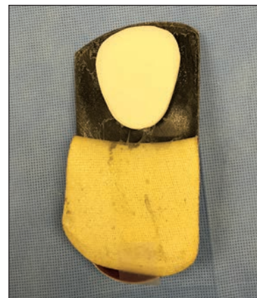
Figure 2: Addition of metatarsal pad

inequality, but there are times when symptoms develop because of this difference. A leg length difference of 1/2 inch or greater often leads to low back pain, hip pain and, many times, creates pronation of the longer leg creating foot and ankle issues such as