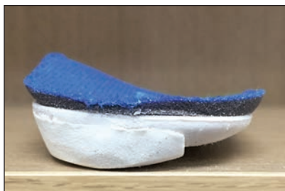
Figure 3: Addition of U-shaped pad for dispersion

overuse injury. If an individual's biomechanical examination reveals only a minimal discrepancy, then symptoms may not occur in a walking gait, but may become obvious during running. A pre-fabricated insole may be used as a trial, either alone or with a