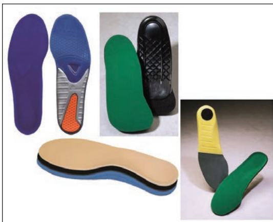
Figure 1: Examples of over-the-counter arch supports

In practice, pre-fabricated insoles do have significant value in certain circumstances. For example, many people have a limb-length discrepancy, either structural or functional. The body at times compensates for this