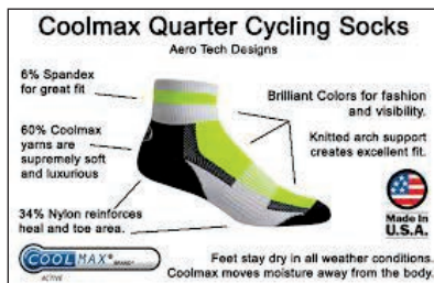
Figure 1: CoolMax® socks.

When combining hydrophobic qualities and mechanical fiber qualities, the fibers that wick moisture are, from best to worst: CoolMax® (Figure 1), acrylic, polypropylene, wool, and cotton.