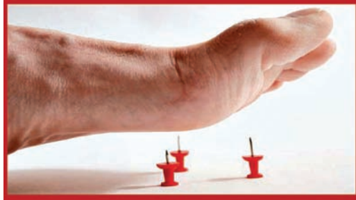
CET stops pain caused by most forms of Peripheral Neuropathy.

Now a number of podiatrists are seeing dramatic results with the NEUROGENX Solution , which is known as an Integrated Nerve Block (INB) or Combined Electrochemical Treatment or Block (CET or CEB). The approach pairs an Electronic Signal Treatment (EST) with a modified, non-steroidal injection regimen. The Neurogenx procedure has been used by physicians in a number of specialties (such as pain management specialists) and most recently has been attracting the interest of a number of podiatrists.