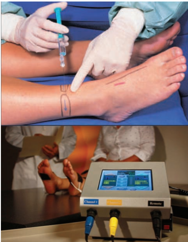
Proven safe and effective, CET combines local anesthetic with Electronic Signal Treatment (EST) to relieve pain and restore feeling.

The treatments begin with the injection of a low-dose local anesthetic usually around the ankle. Then the EST is applied to the affected area. “The local anesthetic really accelerates the results,” according to Martellini, “but EST does the heavy lifting.” It drives the anesthetic to the more conductive tissue; it produces and delivers electronic biologically-effective signals. EST can be used to help heal neurogenic conditions like peripheral neuropathy, along with inflammatory conditions, like plantar fasciitis, as well as vascular conditions. This information from NEUROGENX includes peer-reviewed published studies.