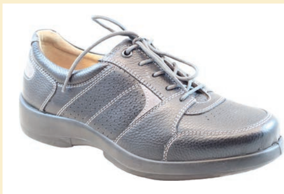
D2017: The Pathfinder

For more information, call 888-493-2859, visit www.pilgrimshoes.com , or click here .