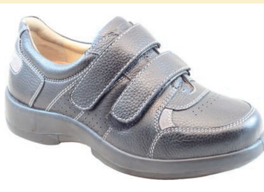
D2018: The Globetrotter