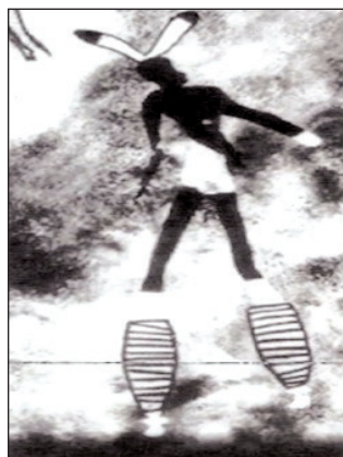
Figure 2: Murals from the Neolithic period showing what appears to be early compression therapy.

deep venous systems are both approximately 80 mmHg when a person is upright at rest. 4 However, during exercise such as walking or plantarflexion, calf muscle contraction increases pressure within the deep veins. This action closes the valves in the perforator veins and propels the blood in the deep veins towards the heart. 2 Subsequent muscle relaxation causes pressures in the deep venous system to fall abruptly to a level lower than that in the perforator veins. This sudden pressure drop of between 0 and 10 mmHg ensures the valves in the superficial system open to refill the deep venous system. 4 Proper functioning of this venous return is dependent on competent valves within the veins to