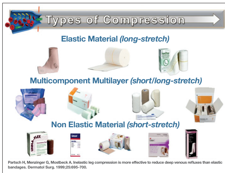
Figure 3: Examples of elastic and inelastic bandage materials.

Multilayer compression bandages are composed of a combination of inelastic and elastic bandages. Patients