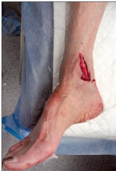
Figure 5: Open fracture following fall on the ice. Wound healed uneventfully following surgical washout and delayed primary closure.

ronment through a break in the skin. Open fractures of the tibia are the most common open long bone fracture, occurring in 3.4 per 100,000 people annually, primarily from high energy trauma. 4,5 Since its description in 1976, the Gustilo Anderson Classification has been the most widely used classification for open fracture management. The rate of infection correlates with the grade of fracture, with 0-2%