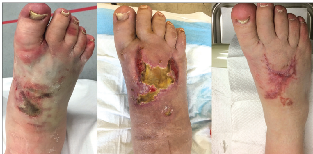
Figure 6: Crush injury and compartment syndrome after patient's foot got stuck under road milling machine. Wound healed at 4 months following emergent fasciotomy, debridements, and skin substitute application.

Historically, emergent surgical debridement of open fractures was recommended within six hours of the injury; however, recent literature has challenged this recommendation. Schenker, et al. performed a