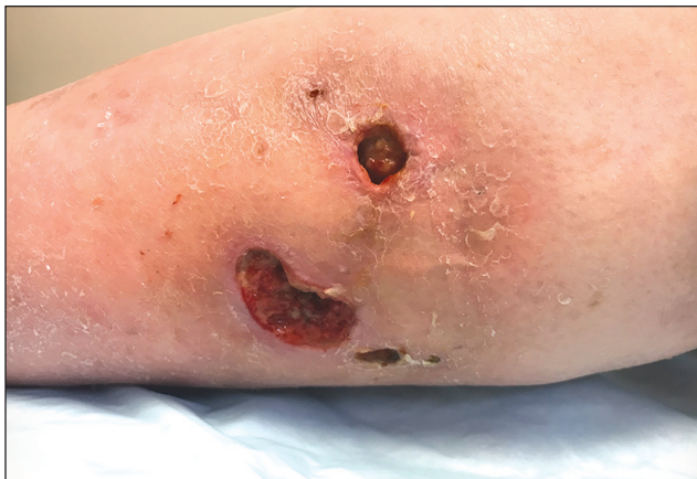
Figure 3: Wound to lateral leg following cat bite. Wound healed in 8 weeks with debridement, local wound care, and compression.

Figure 1 demonstrates a 61-year-old healthy male who suffered a chainsaw injury. The patient presented to the Emergency Department with a first metatarsophalangeal joint laceration and associated extensor hallucis longus tendon injury. Tetanus status was assessed, antibiotics administered, and irrigation performed in the emergency department. MRI revealed a greater than 2 cm gap at the extensor hallucis longus tendon. Surgical repair was required for irriga-