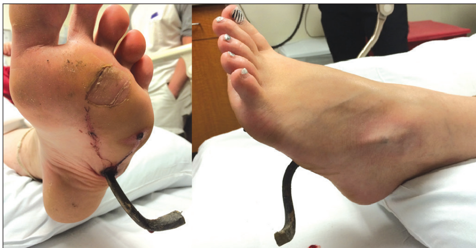
Figure 4: Puncture wound after stepping on a gardening tool while barefoot. Wound healed uneventfully following surgical removal of foreign body and washout.

Figure 2 demonstrates the initial presentation of a 61-year-old healthy male who suffered a burn to his anterior ankle after spilling scalding hot oil while working in a restaurant. The wound healed in five weeks with local wound care consisting of debridement, silver sulfadiazine, and compression. Topical Lidocaine was used prior to debridements.