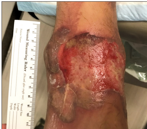
Figure 2: Burn wound to anterior ankle after spilling hot oil. Wound healed in 5 weeks with local debridement, Silver Sulfadiazine, and compression.

Wounds in the emergency setting require thorough irrigation. Baseline x-rays should be performed to rule