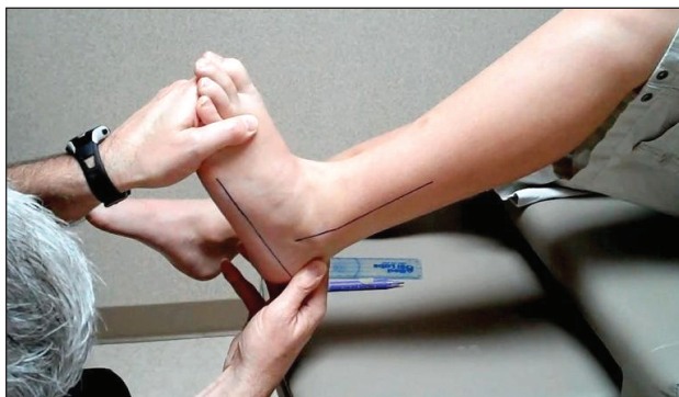
Figure 3: Evaluation of the ankle joint dorsiflexion with the knee bent removes the pull of the gastrocnemius muscle and allows the practitioner to determine whether equinus is gastrocnemius equinus or gastrosoleal equinus.

ambulation, therefore the term pseudoequinus. The combined equinus is just a combination of one type of muscular and osseous equinus.