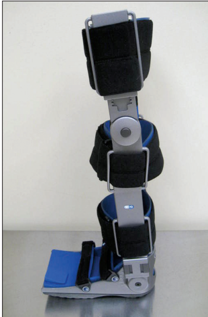
Figure 6: In this side view of the EQ/IQ brace, you can see the hinge to be placed at the knee joint. When the brace crosses the knee joint, it allows for stretching of the entire GSC. The hinge allows for the brace to engage just the soleus if taken down or the entire GSC if left intact.

or have a relationship to equinus will be discussed with some of the well-documented literature.