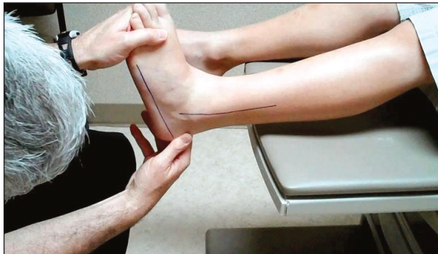
Figure 2: The Silverskiold test is used to evaluate for equinus. This demonstrates evaluation of the dorsiflexion of the ankle joint with the knee extended.

There are two primary types of equinus—muscular and osseous, with subgroups of each kind. In the muscular group there can be either spastic or non-spastic equinus. Either of these subgroups of spastic or non-spastic equinus can further be broken down into gastrocnemius or gastrosoleus equinus. The osseous forms of equinus include: anterior tibiotalar exostosis (best seen on a lateral charger view on X-ray), distal tibial-fibular osseous bridging from prior trauma, pseudoequinus and combined equinus. Pseudoequinus occurs in the cavus foot structure where ankle joint dorsiflexion occurs to dorsiflex the forefoot, which is plantarflexed to the rearfoot. The ankle dorsiflexion used to do this then limits the amount available for normal