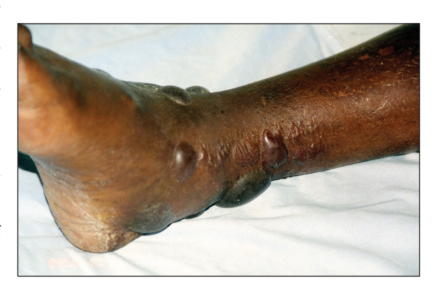
Figure 7: Fracture blisters secondary to a talar neck fracture. This was consulted for a "vesicular skin condition".