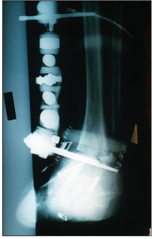
Figure 6: External fixator in place until definitive surgery