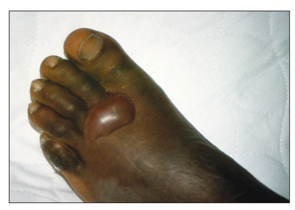
Figure 4: Serous fracture blister