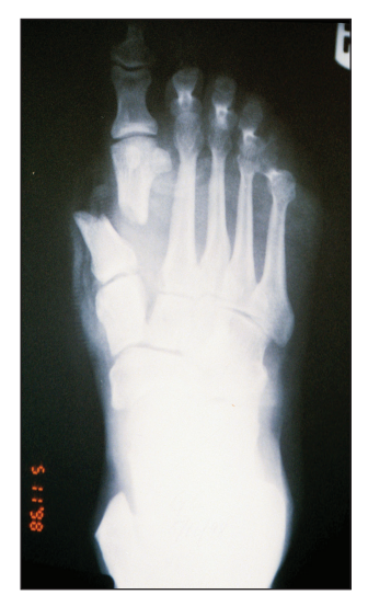
Figure 3: Open fracture 1st metatarsal