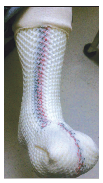
Figure 3: Total Contact Cast (TCC)

Relief of pressure from the area of the wound is the single most important issue that should be addressed upon first presentation. Plantar foot ulcers typically result as a consequence of abnormal foot pressures and repetitive moderate stress encountered by the neuropathic foot while ambulating.<sup>16</sup> Footwear needs to be evaluated, and ill-fitting shoes must be replaced. If the diabetic wound is on the plantar surface of