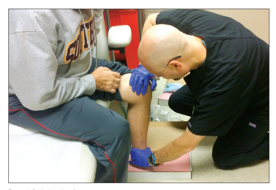
Figure 6: Pedorthic shoe fitting

Diabetes is a complicated disease with many serious sequelae. Development of foot ulcerations are very common in patients with diabetes. These patients often fail to detect foot ulcerations until they become large and/or infected. These ulcerations can deteriorate quickly due to the multiple co-morbidities found within this patient population. Prompt and aggressive wound care is key to successful treatment of diabetic foot wounds. Wound healing centers with rigorous and proven protocols to manage these types of ulcerations are the cornerstone of therapy. Con-