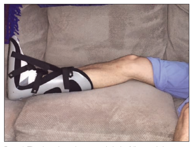
Figure 6: This photo shows that even with the leg fully extended, it is difficult to get the patient to fully extend their knee, and if the tibia is not externally rotated via subtalar supination, then physically it is all but impossible to put the knee into full extension.