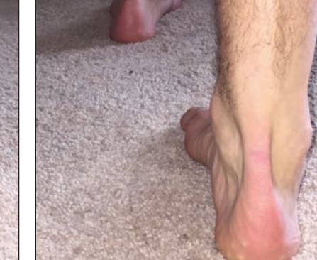
Figure 5: This photo shows the correct position of the subtalar joint in supination that allows external rotation of the tibia and therefore full knee extension, locking of the midtarsal joint to prevent dorsiflexion occurring through the midfoot.