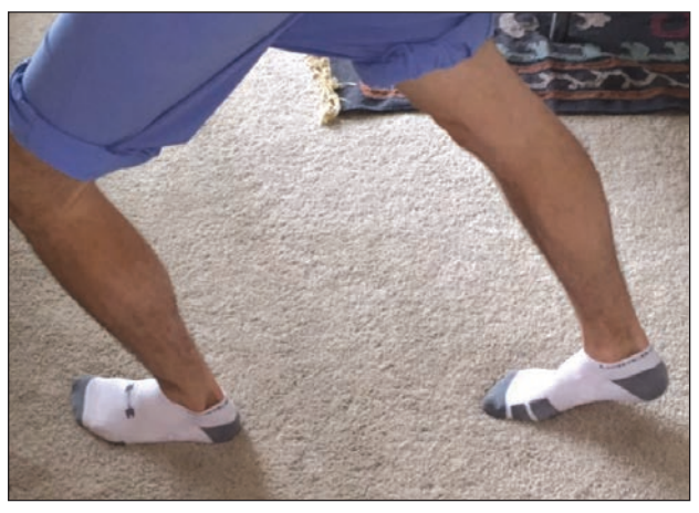
Figure 1: This photo shows improper techniques of the runner's stretch with the back heel off the ground, preventing a full stretch of the gastroc-soleal complex.

The authors stated, "Calf muscle stretching provides a small and statistically significant increase in ankle dorsiflexion. However, it is unclear whether the change