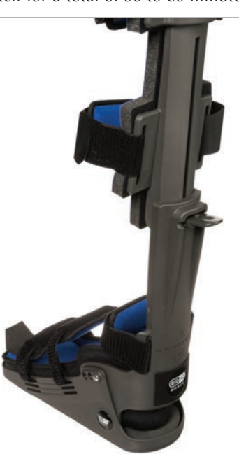
Figure 8: EQ/IQ brace showing extension of the leg component to go above the knee to maintain the knee in full extension to adequately stretch the gastroc-soleal complex.

1) Night splints do not go above the knee, and therefore do not lock the knee into full extension even when the patient is using it with the leg extended. It is uncomfortable to fully extend the knee while dorsiflexing the ankle. Additionally, the knee