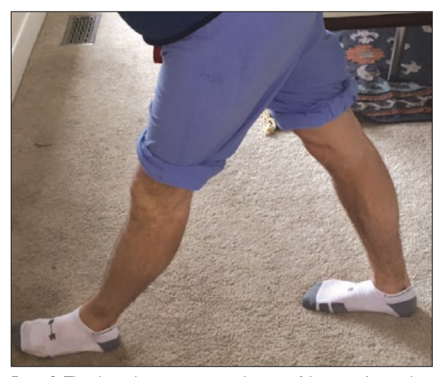
Figure 3: This photo shows improper techniques of the runner's stretch with the front knee straight, preventing full stretching of the rear leg gas-troc-soleal complex.