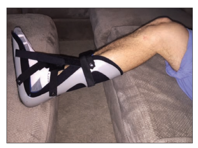
Figure 7: This photo shows the knee bent while wearing a night splint, resulting in sub-optimal gastrocsoleal stretching.