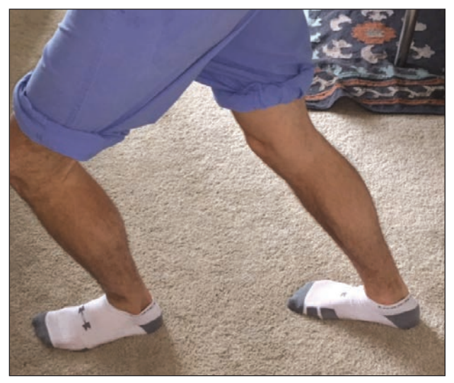
Figure 2: This photo shows improper techniques of the runner's stretch with the back knee bent, preventing stretching of the gastrocnemius component of the gastroc-soleal complex.