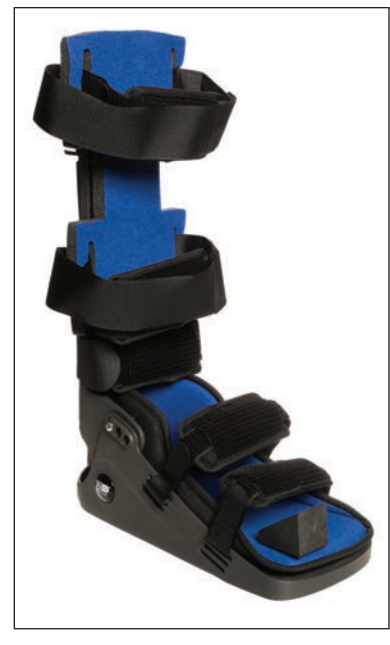
Figure 9: EQ/IQ equinus brace, showing toe wedge to dorsiflex the hallux, lock the midtarsal joint, supinate the subtalar joint, and externally rotate the tibia that allows for full knee extension.

The EQ/IQ equinus brace is one of the most significant improvements in the conservative management of equinus deformity in decades. This brace has several fea-