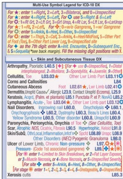
The Multi-use Symbol Legend and Section L image referenced in the accompanying profile to demonstrate ease-of-code-use.

To see more or get your supply of UniversalEncounter 2016 forms, go to www.dpmforms.com . To contact DocuForms, call 1-800-995-2001 or click here.