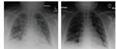
Before Laser Therapy After Laser Therapy

MLS Laser Therapy from Cutting Edge Laser Technologies is commonly used to relieve pain and inflammation associated with a wide range of conditions, including plantar fasciitis, Achilles tendinitis, and post-surgical healing. This technology utilizes synchronized continuous 808nm and pulsed 905nm emissions to promote blood circulation and lymphatic drainage, induce analgesia, and accelerate healing.