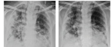
Before Laser Therapy After Laser Therapy