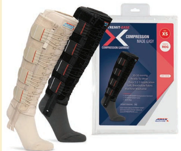
amerxhc.com/extremit-ease/ or click here for more information and to conveniently order online.

Ready to add the tan garment to your product offerings? Contact your AMERX Account Manager today at (800) 448-9599 and ask about the new tan EXTREMIT-EASE Compression Garment or visit